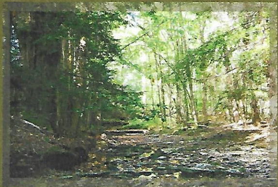
Lake SWCD holds easements that protect specialty crop land (top), nursery land (middle) as well as natural areas (bottom).

425 tons of Sediment, 7.6 tons of Nitrogen and 1.3 tons of Phosphorus from entering our streams annually.