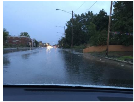
[The photos of sitting water for days at a time at the corner of Nobel Road and Euclid Avenue are still in my mobile.]