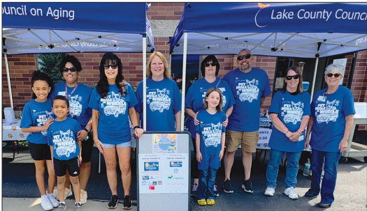
The Meow or Woof Pet Meals on Wheels program celebrated Pet Appreciation Week with a fun, family and pet-friendly event on June 1, 2024.